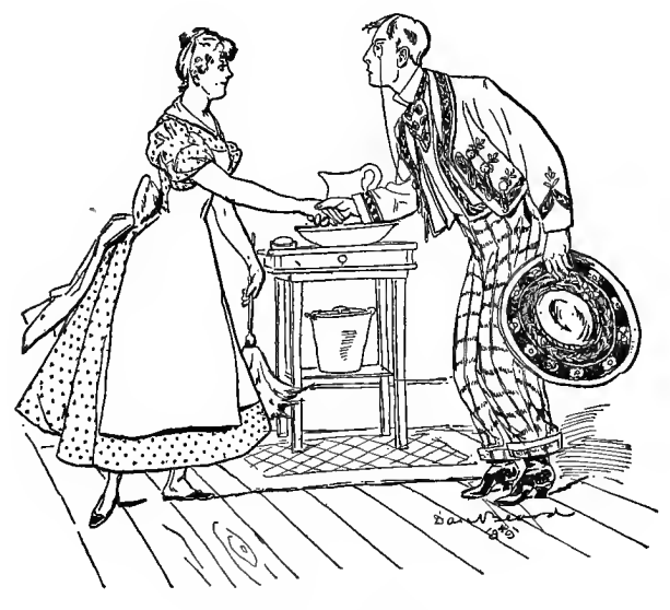
"How do you do?"

chambermaid, or to the heiress of a mechanics' boarding house. His other self—the self which recognized the equality of all men—would have managed the thing better, if it hadn't been caught off guard and robbed of its chance. The young girl paid no attention to the